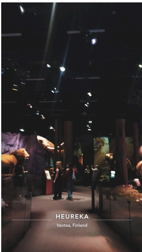
HEUREKA Vantaa, Finland