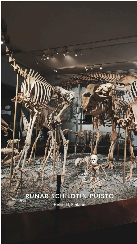
RUNAR SCHILDTIN PUISTO Helsinki, Finland